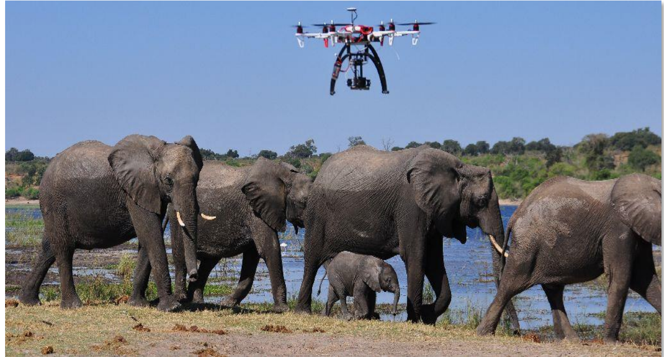
Unmanned Aerial Vehicles