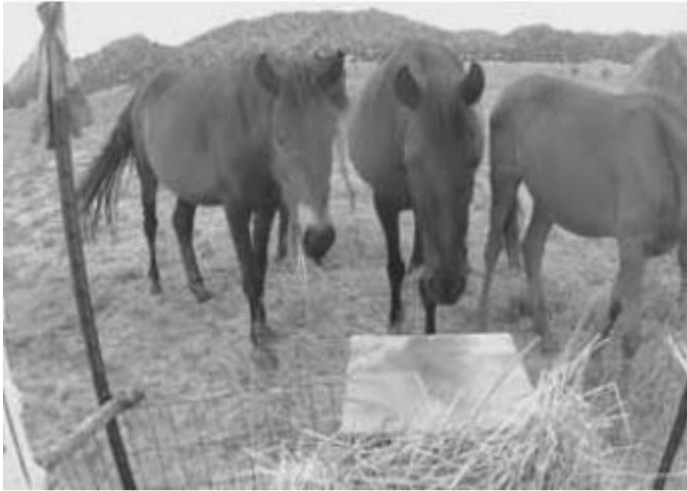
Stationary Radio-Controlled Devices