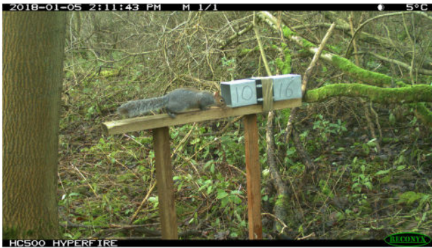
Fig. 1. Grey squirrel using a feeder during a bait-uptake study, recorded with a remote camera. Feeders were fixed to 1 m high stands to help prevent access by non-target animals.

checked at least once every 24 h. For animal-welfare and health and safety reasons, traps were not set if heavy rain, snow, high winds or temperatures below 2°C were forecast. This meant that for winter surveys, traps were often set early morning and checked mid-late afternoon. Trapping was typically conducted over consecutive days, Monday to Friday, until squirrel capture rates were reduced to an average of less than one per day over three consecutive days.